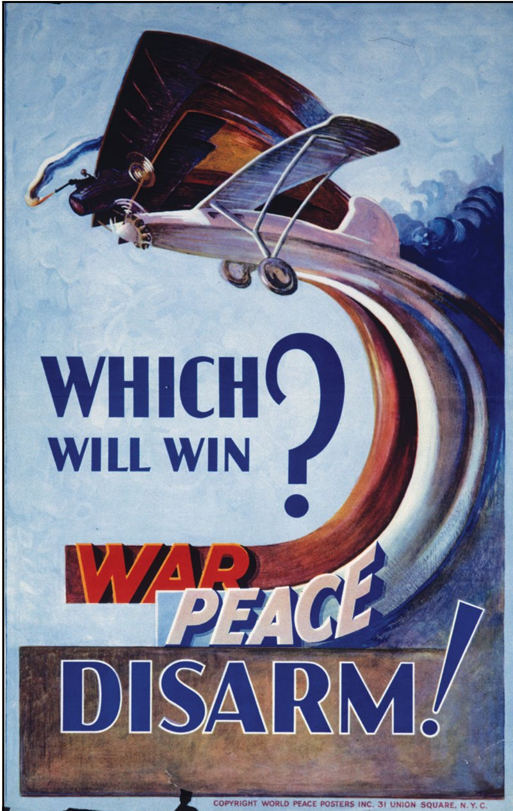
Hoover Institution Archives Poster Collection, US 5543