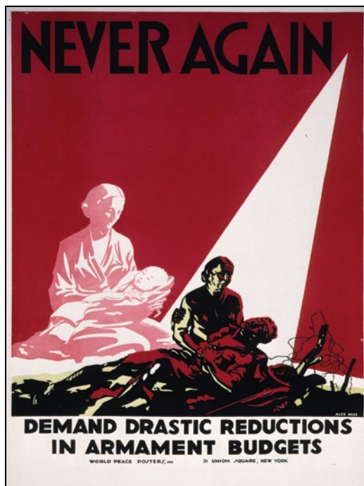
Hoover Institution Archives Poster Collection, US 4818

Chemical weapons have not gone away, in spite of the Geneva Protocol of 1925. Saddam Hussein's Iraq, a treaty signatory, used them in its war against Iran beginning in 1983 and against its own Kurdish population in the Halabja massacre of 1988. More recently, the weapons have been used in the Syrian civil war. In 2013, Syria admitted to having mustard gas and other banned chemical weapons, also in violation of Geneva, of which it was a signatory. The United States and Russia made a deal with the Syrian government to destroy those weapons, but US intelligence believes that the Syrians concealed some from international