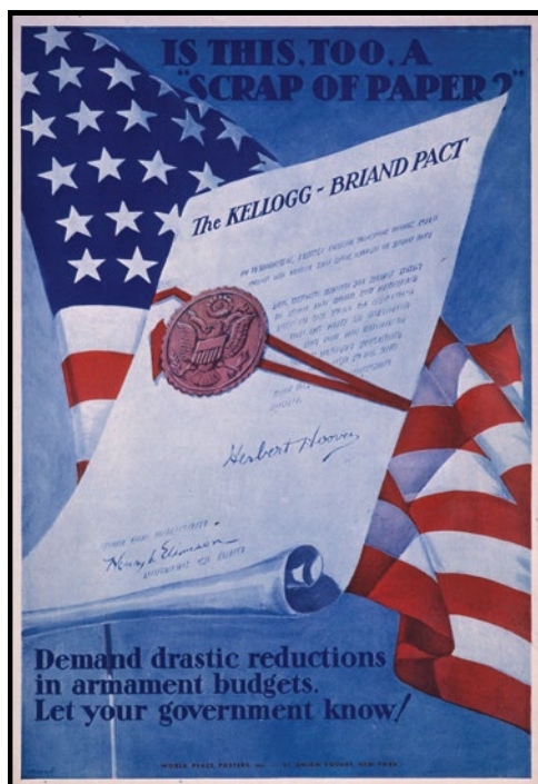
Hoover Institution Archives Poster Collection, US 5518

One of the most successful arms control treaties of the modern era was the Washington Naval Treaty (WNT), which limited dreadnought construction to fixed quotas among the major powers after World War I. Often seen as emblematic of the West's unrealistic pacifism in the wake of the War to End Wars, the WNT was actually a US policy success, allowing Washington to maintain parity with the United Kingdom, stay ahead of all other rivals, and save money in the process. Moreover, at the time, anything that reduced the naval power of potentially hostile countries tended to privilege American security. Yet even this agreement had flaws. The Washington Naval Treaty did not solve our security problems between the two world wars, and by creating an illusion of safety it may have made World War II more likely.