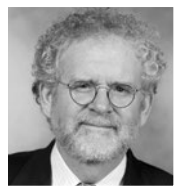
WALTER RUSSELL MEAD is the James Clark Chace Professor of Foreign Affairs and Humanities at Bard College and editor at large of the American Interest . Until 2010

If, as seems likely, the Obama administration stays on the second course of action, the growing geopolitical instability in the region is likely to undermine the nuclear agreement as well.