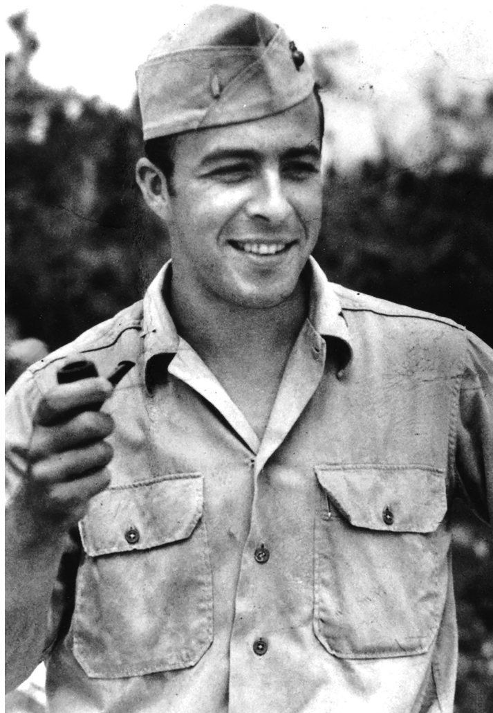
US MARINE CORPS 1943