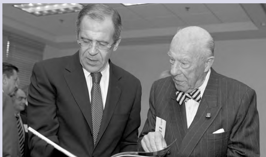
Russian minister of foreign affairs Sergey Lavrov (left) and Hoover distinguished fellow George P. Shultz examine materials on international affairs before the September 20 dinner.