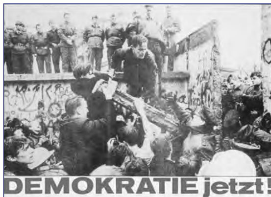
One of the many dramatic photos featured in 'Revolutionary Eye.'

medium in which to work, representing things like the abuse of the environment, grievance, the threat of war, or other general grievances. You can reveal the bitter truth through photographs."