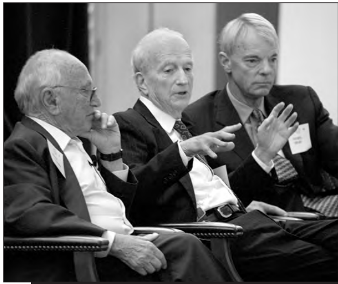
Nobel laureates (from left to right) Milton Friedman, Gary Becker, and Michael Spence discuss issues on September 20.

Taking into consideration the rising cost of gasoline, Becker discussed the causes and solutions to this problem. Becker, who won the Nobel Prize in 1992, is the Rose-Marie and Jack R. Anderson Senior Fellow at the Hoover Institution and a professor at the University of Chicago. He received the