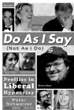
Do As I Say (Not As I Do): Profiles in Liberal Hypocrisy (hardcover) by Peter Schweizer

The book includes nearly 300 illustrations, including political posters, photographs, film stills, original artwork, and typed and holograph public and private manuscripts, letters, and diaries.